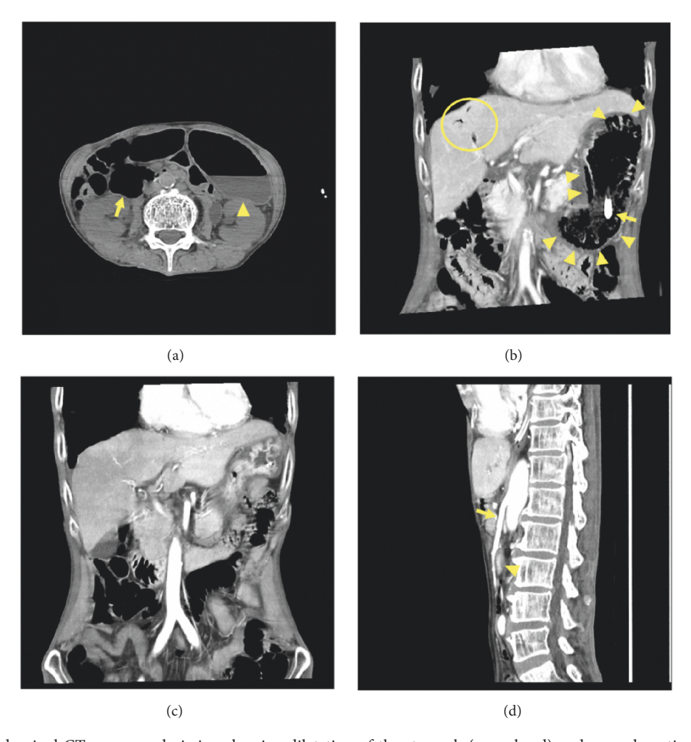
FIGURE 1: Plain abdominal CT scan on admission showing dilatation of the stomach (arrowhead) and second portion of the duodenum (arrow) (a). Contrast-enhanced CT scan on hospital day 11 showing gas within the wall of a distended stomach (arrowheads) and portal vein (circled region). An arrow demonstrating the tip of the feeding tube (b). Follow-up CT scan showing improvement of gas in the stomach and portal vein (c). Sagittal view showing an acute angle of the aorto-superior mesenteric artery (arrow) and a collapsed duodenum (arrowhead) (d).

ventilated due to his altered level of consciousness resulting from severe hypercapnic respiratory failure. While computed tomography (CT) examination of the head revealed no abnormalities, abdominal CT showed dilatation of the stomach and second portion of duodenum (Figure 1(a)). He was admitted to the emergency intensive care unit for further management.